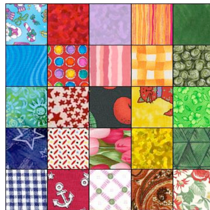
pink/ purple row with black center square

6. You now have 5 rows of 5 squares each. Join the rows to form a 5 x 5 square. Join the rows in whatever order you wish, AS LONG AS the pink/purple row is row three of the five. The black square will be the free space at the center of the "card".