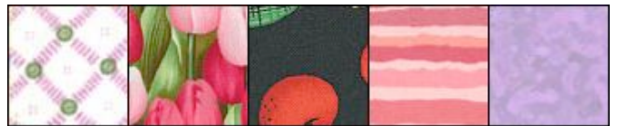
plaid, floral, BLACK, stripes, solid

5. Join 4 (2½") squares of assorted pink and/or purple prints into two pairs. Sew one of the pairs to one side of a black square (2½") , and the other pair to the opposite side of the black square. This is your final row.